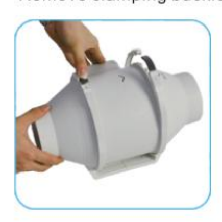
Apply to 100/125mm Remove clamping buckle