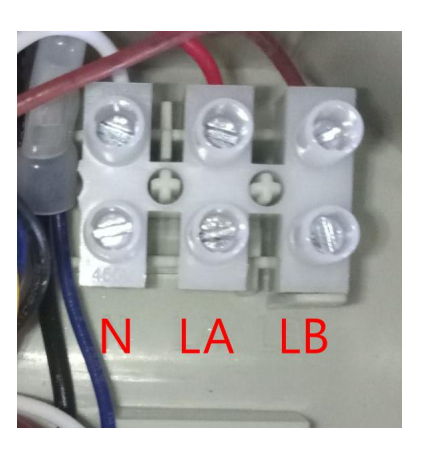
Figure 4 Figure 5

EU type 220 V single phase: Connect "N" and "LA";