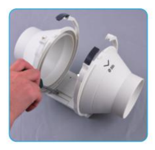
Fix the support