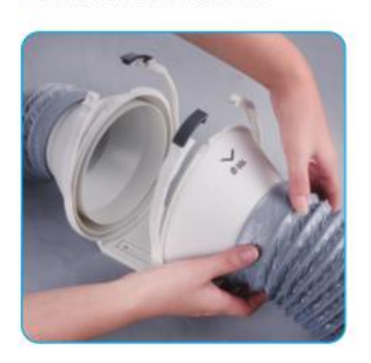
Connect the ducts