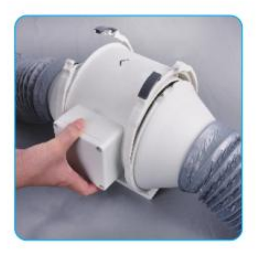
Place the motor body