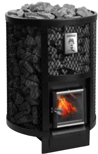
HARVIA VILLE HAAPASALO 240

WK240VHLUX width 600 mm, depth 600+180 mm, height 830 mm, weight 80 kg