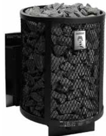
HARVIA VILLE HAAPASALO 240 DUO