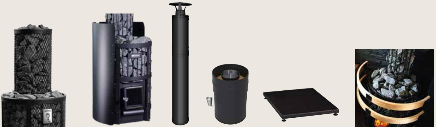
Smoke pipe guard WL300VH